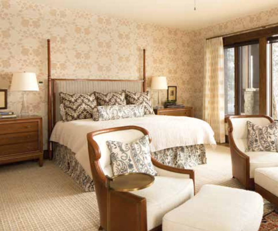
LEFT: Classic, leather-backed Baker chairs face the hearth in the bedroom, giving a subtle Western twist to the light and airy space. The Paper Mills Pablo wallpaper from Supply Showroom in Austin, Texas, creates the perfect backdrop for a restful retreat.